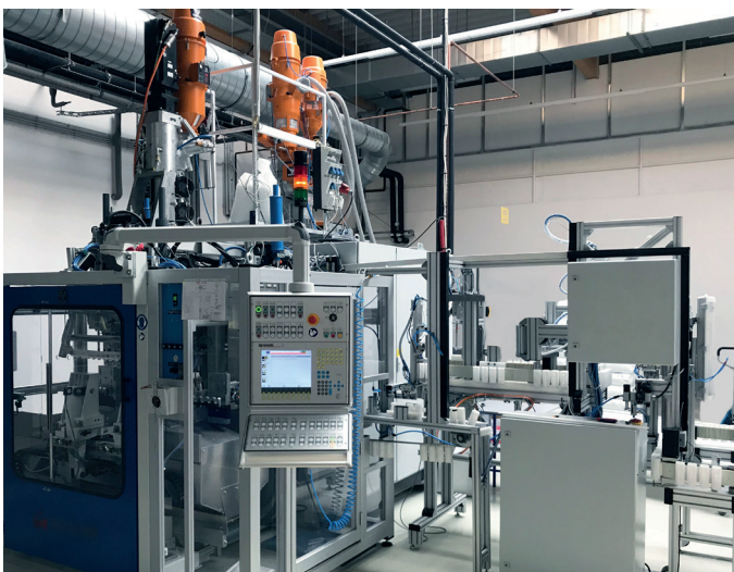
Tube production facility at Minitube

This is only possible when the full production line is in control of the manufacturer, as is the case with Minitube's production of boar semen tubes in its own specialized production facility.